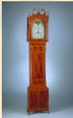
Tall case musical clock

Tall case clocks were popular. Simple clocks built in rural areas often had wooden works while elegant clocks sold in large towns had cases with inlay and fine movements. This c. 1805-1810 clock has works by Nicholas Goddard , a well-known Rutland clockmaker.