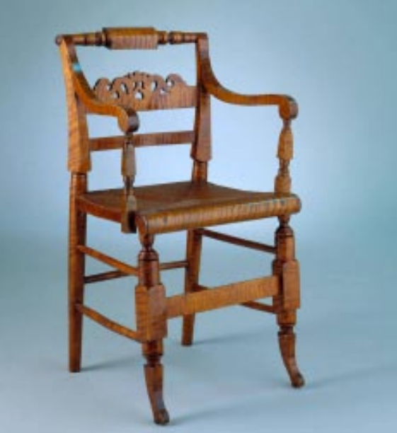
Armchair, 1815-1830/ The Bennington Museum