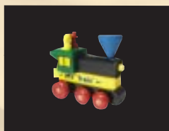
Maple Landmark Woodcraft

Maple Landmark Woodcraft of Middlebury, founded in the 1970s, is one of the largest manufacturers of wooden toys in the U.S. Its award-winning line of Vermont-made toys includes the Name Train and MY Train wooden railroad systems, games, building blocks, trucks, rattles, and pull toys as well as laser-cut ornaments and home accessories.