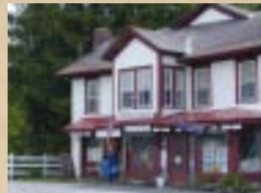
East Poultney General Store/Joel Flewelling