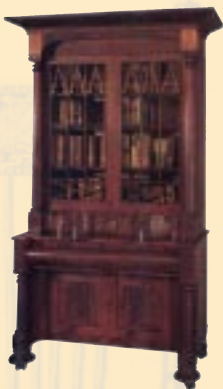
Empire cabinet-bookcase/ Henry Sheldon Museum

The Middlebury workshops of Hastings Warren produced custom and ready-made furniture for a fashion-conscious clientele. This Empire cabinet-bookcase was built around 1825 from local white pine and cherry. Its fine mahogany and satinwood veneers, carved Ionic columns, and jigsaw work are evidence of a highly skilled cabinetmaker.