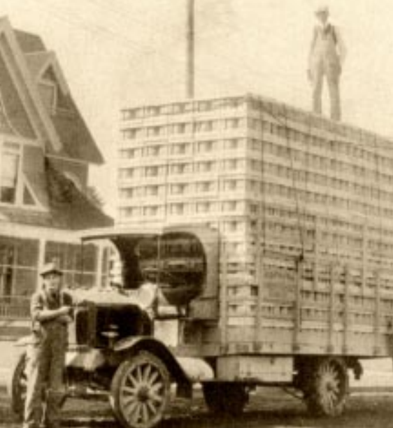
1920s truck loaded with hundreds of butter tubs