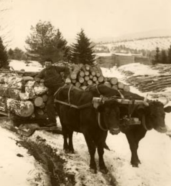
Oxen pulling log sled/Bill Gove