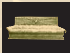
Bristol Manufacturing Co.

The Bristol Manufacturing Company , incorporated in 1877, was the largest maker of caskets in the country, a business so profitable they discontinued making baby carriages. Other Bristol industries made chair stock, butter tubs, wooden boxes, silos, hanging clothes dryers, and woodenware.