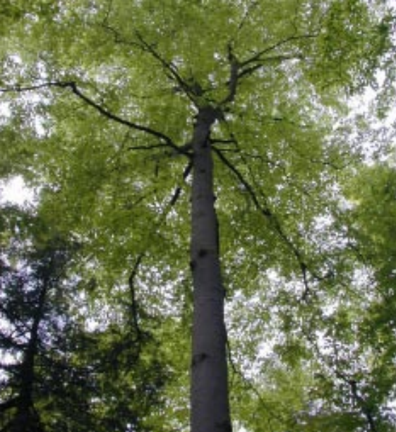
Beech tree