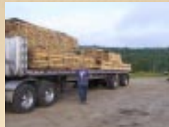
Lumber from the S.A.W. Mill